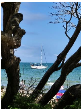
Photo Above shows the happy Group at Knoll Beach Café! Photos Left and Right were both taken on that trip, showing the beach and dunes at Studland.