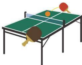
Table Tennis for Improvers

Did you love playing Table Tennis as a Teenager? Or even as an "Older-ager"??!!